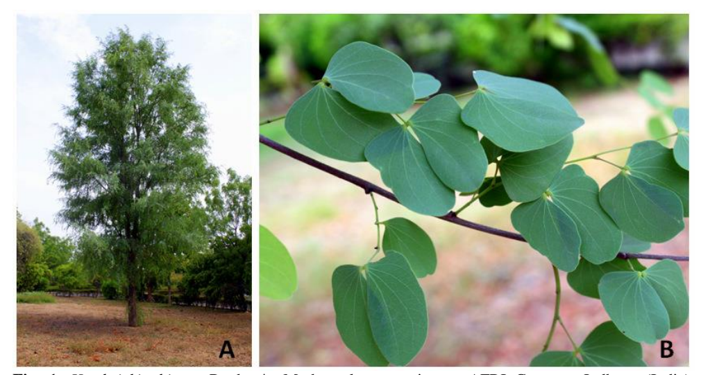
Fig. 1. Hardwickia binata Roxb. A. Mother plant growing at AFRI Campus, Jodhpur (India); B. Close-up of a stem nodal segment with pinnate bifoliate leaved. The stem nodal segment was used as explants.

Plant material and explants source : All explants of H. binata were collected from a healthy mother tree (Fig. 1) growing in and around AFRI (Arid Forest Research Institute), Jodhpur. For optimization of surface sterilization procedure for hard tissues (mature nodal segments and mature seeds) all explants were first washed in running tap water for 5-10 min to remove surface contaminants. They were then washed with detergent (Tween 80) for 7-10 minutes followed by rinsing with distilled water 4-5 times. The explants were immersed and agitated constantly in freshly prepared Streptomycin (0.5 g/100 ml) and Bavistin solution (0.1 g/100 ml of distilled water) for 10-15 minutes followed by rinsing with distilled water. The explants were then treated with 5–20% NaOCl (Sodium hypochlorite) solution at various concentrations and different time duration.