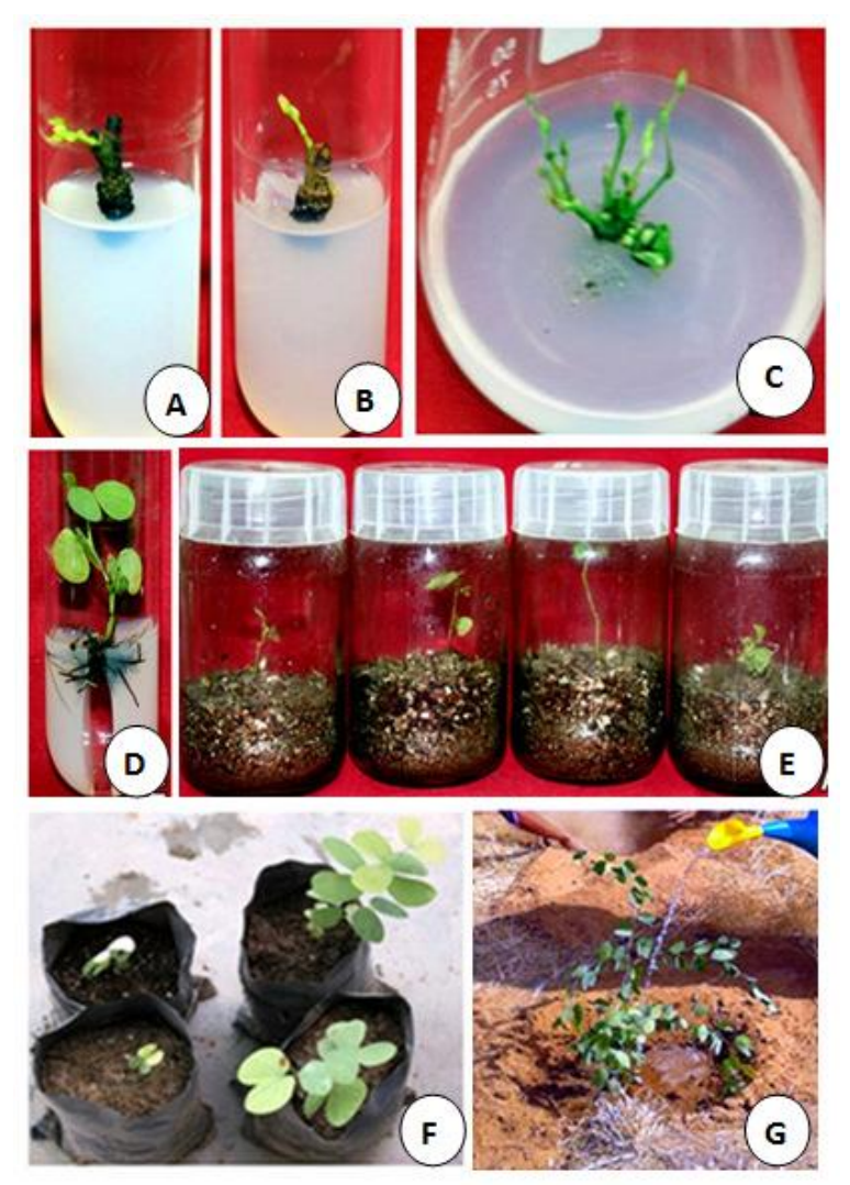
Fig. 2. In vitro propagation of H. binata . A. & B. Axillary bud-break; C. Shoot multiplication; D. In vitro rooting; E. In vitro hardening (acclimatization); F. Plantlets in poly – bags ready for field transfer; G. Tissue culture raised plant growing in field condition

Data analysis : Each treatment consisted of 10 explants and all experiments were repeated thrice. The results were analyzed statistically using SPSS ver. 10 (SPSS Inc., Chicago, IL, USA). The results are expressed as the means \pm SE of three experiments.